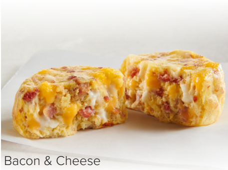
Bacon & Cheese